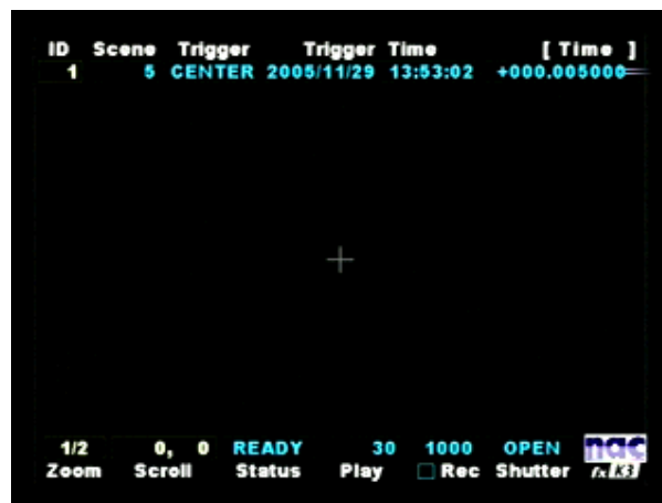
READY Mode – Set start frame