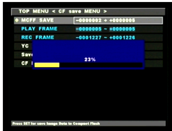
CF save MENU – Saving