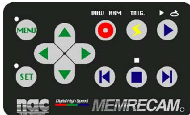
Camera Control Touch Pad

The Rear Camera Control Touch Pad is located on the top of the MEMRECAM fx DRP rear panel. There are 12 keys and 8 LED as follows: