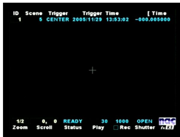
READY Mode – Set start frame