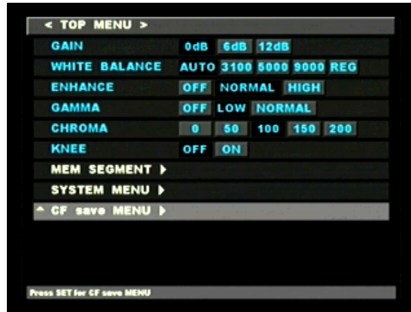
TOP MENU – CF save MENU